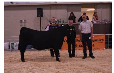
FFA RGC Beef Macacla LaPorte