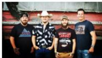
Nash Brothers September 7th @ 5:00 p.m.