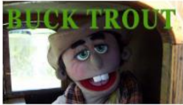
Buck Trout Multiple Performances - See Fair Schedules

During the fair we will have daily schedules all of the entertainment.