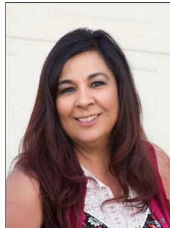
Lisa Miller Cashmere