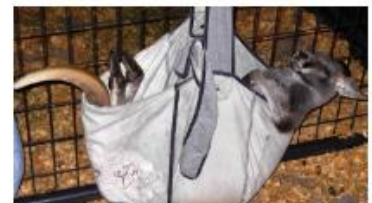
Aussie Kingdom Multiple Performances - See Fair Schedules