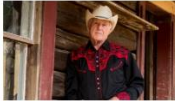
Slim Chance Thursday, September 5th @ 1:00 p.m. - Friday, September 6th @ 5:30 p.m.