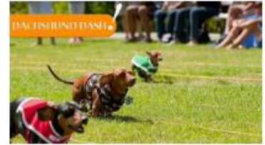
Dachshund Dash Race Date: Saturday, September 7th @ 12:00 p.m.