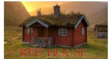
Red House Saturday, September 7th @ 1:00 p.m. to 2:30 p.m.