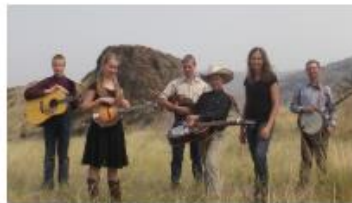
Daybreak Canyon Bluegrass Thursday, September 5th @ 12:00 noon & 2:00 p.m.