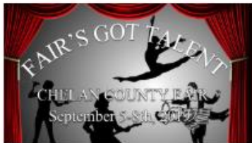
2019 Chelan County Fair's Got Talent Fair Got Talent 2019 Thursday, September 5th & 8th