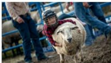
Mutton Busting Multiple Performances - See Fair Schedules