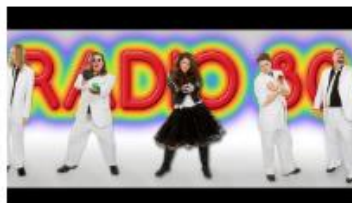
Radio 80 Friday, September 6th @ 9:00 p.m.